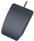
Single Foot Pedal FS007RJ11