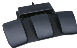
Triple Foot Pedal FS007TAF