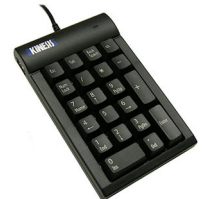
Low Force Keypad AC210USB-blk